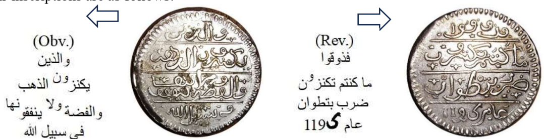
Fig. 9 A silver Mithqal for Sidi Mohamed b. Abdullah, Tetouan Mint 1195 AH, 28.2g, 39mm, Bank Al-Maghrib, No.467.

The coins of our selected group consist of the mithqal struck exclusively at Tetouan in 1195 AH/ 1781 AD. Two distinct variants of this singular mithqal type were discovered, differing solely in their diameter. The first version's diameter was approximately 32 to 34 millimetres, however the other version varied from 39 to 41 millimetres. Their weights are very close, and their inscriptions are as follows: