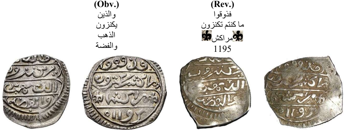
Fig. 11 A Dirham of Sidi Mohamed b. Abdullah, Marrakesh mint, 1195 AH, 2.79 g,23 mm. Jesus Vico, Auction 165, 23 Feb 2023, Lot 2687.

The design of this type has an outer circle consisting of denticles, which is followed by a linear one that surrounds the central inscriptions. The inscriptions are arranged in four lines on both the obverse and reverse, with three horizontal lines separating them and ending in forked edges. The writings are as same as the first variant of the light bunduqi , they can be read as: